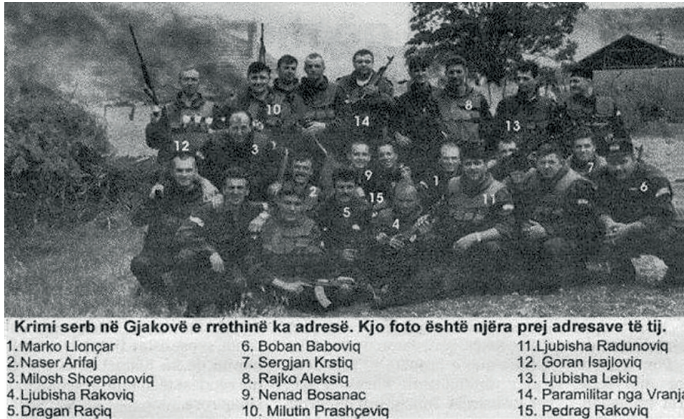
Figure 3. On April 27, 1999, 25 Albanians were killed in Guskë in Gjakova

houses and commercial premises were burned. burned in other parts of the city. 12 objects under the protection of the Department of Monument Protection were burned, 1 was shelled, 1 was destroyed, and 6 objects were damaged (Fig. 3).