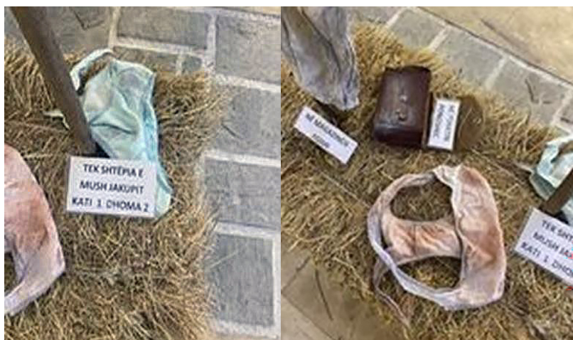
Figure 4. Evidence of violence against Albanian girls and women found in and around Gjakova